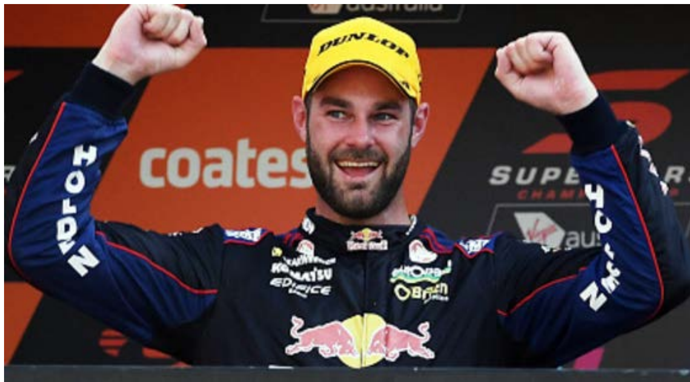
Auckland Car Club member Shane Van Gisbergen crowned V8 Supercar Champion 2016

P O Box 27063, Mt Roskill, Auckland, New Zealand 1440 Phone: (09) 620-9797 Facsimile: (09) 620-5247